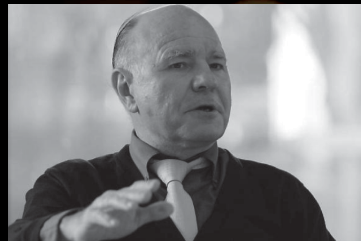
Marc Faber Publisher of GloomBoom&Doom Report, Investment Advisor of MARC FABER LIMITED